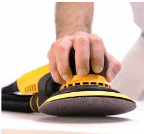
Optimal performance and life time on primer sanding applications.