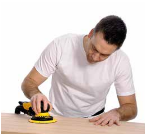
Excellent cut on harder wood types such as beech and oak.

Abranet® Ace – a complete dust free sanding experience!