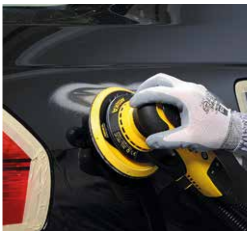
Efficient paint removal on hard clear coats.