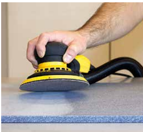
Superior and fast cutting on various solid surface types.